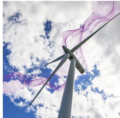
Climate & energy