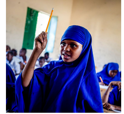
Education & research